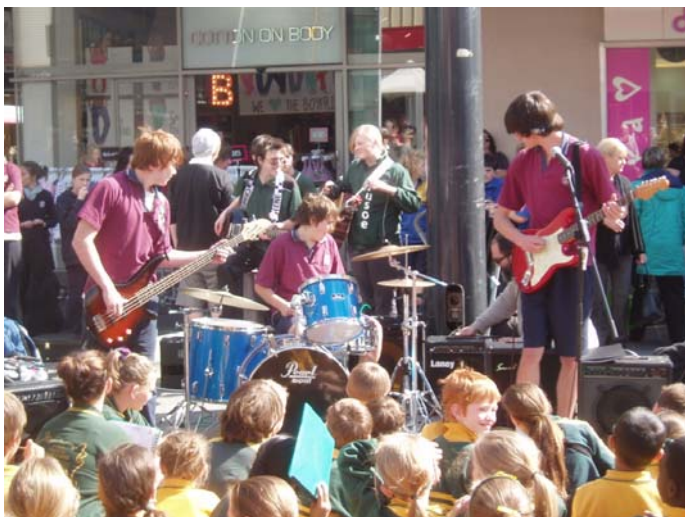
Students performing in the Mall.